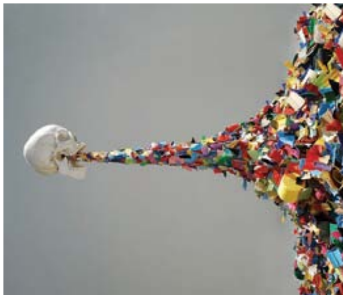
TYPOE- Confetti Death, 2010 | Represented by SPINELLO