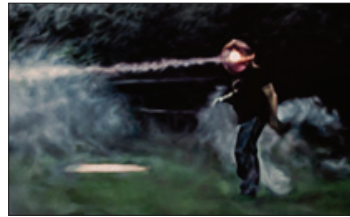
CHARLES MOODY "Untitled" (man), 2011 Oil-on-panel