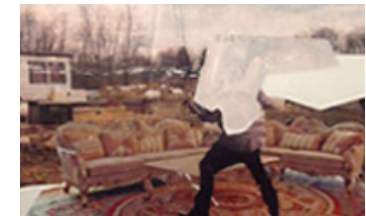
MATTHEW CONRADT Shelters, 2012 Mixed media