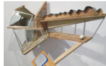
JOAO Mouro Mouradia Walteregolivia, 2012 Mixed media