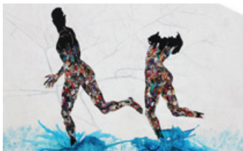
VITSHOIS MWILAMBWE BONDO Untitled, 2011-12 Collage and acrylic on canvas