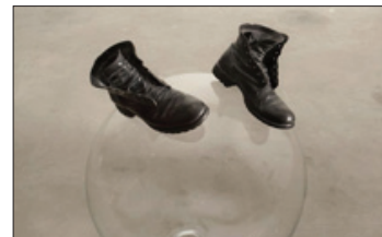
JAVIER PAREZ A 60 cm. del suelo Mixed media