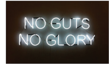
RUBY ANEMIC No Guts No Glory, 2012, Sculpture, Neon, 19" x 48"