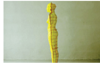
SILVIA SCHREIBER Crossover Sculpture, Paper, 180x60x40cm