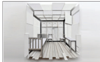
PAOLO CAVINATO Rilievo #1, 2012 Cardboard, acrylic, paper, plexiglass 85cm x 85cm x 8cm