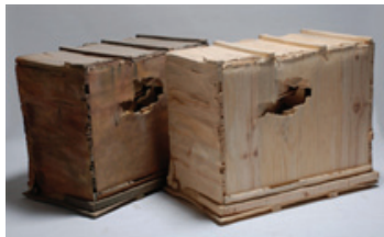
JIAO XINGIAO Untitled, 2010 Wood, Painted fiberglass, 108x87x88cm