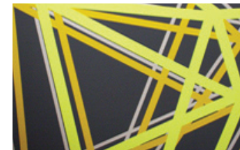
GARETH JENKINS Grey 2429, 2012 Acrylic on birch plywood, 12276cm